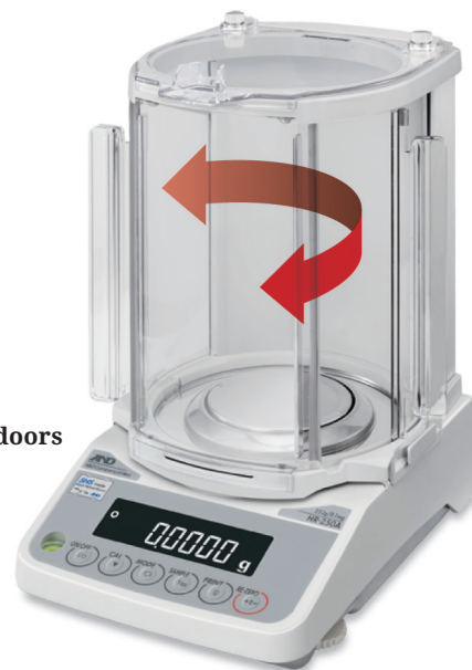
Rotary sliding doors

The breeze break is easily removed using a unique clip system, allowing fast, simple cleaning and use in confined spaces like gloveboxes and controlled environment cabinets.