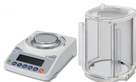
Removable breeze break

The breeze break is treated with an antistatic agent to ensure stable weighing. It also offers a large working space and can be detached for better portability and easy cleaning of the balance.