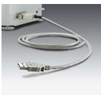
RS-232C/USB interface cable