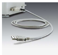
RS-232C/USB interface cable

*) Triangular weighing pan shape. Ø = diameter of the inner circle; the shaded area is completely available for use.